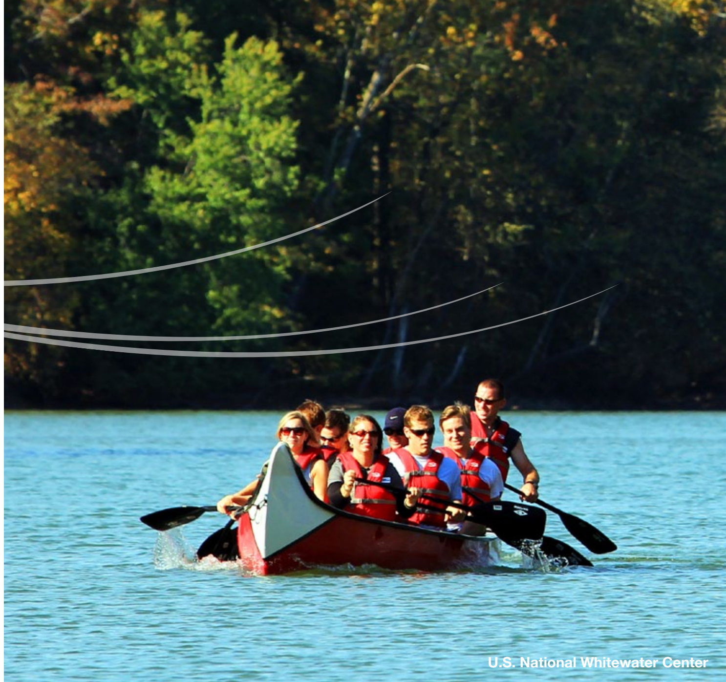
U.S. National Whitewater Center

This newsletter is made with 30% Post Consumer Fibers